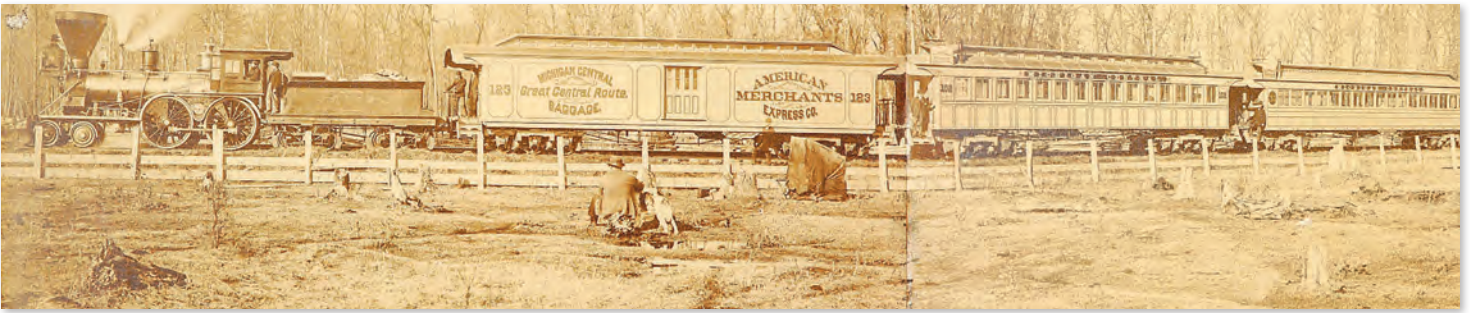
Michigan Central Train. Albumen prints by the Cadwallader Brothers, circa 1866. Pulled by the locomotive Persian, this magnificent express train stopped west of Detroit for this posed panorama, made up from two plates. The photographer's dark tent is likely in front of the baggage car.