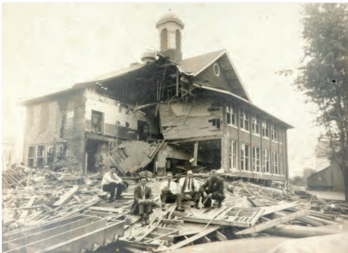
Bath School, after May 18, 1927. Gelatin silver print likely by Hiram Marple, working for Leavenworth Photographic of Lansing. Local school board treasurer Andrew Kehoe, angry at the cost of the new Bath Consolidated School, dynamited the building while classes were in session, killing 44, including himself. He had just previously killed his wife and set fire to his home. The Bath School Bombing of 1927 still stands as our nation's deadliest school attack.