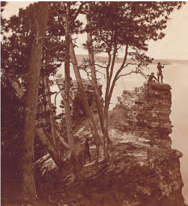
“Pictured Rocks-The Chapel.” Detail of a stereograph by Brainard F. Childs, circa 1873. Childs, who excelled at composing dramatic three-dimensional images, explored the Lake Superior region by land and water.