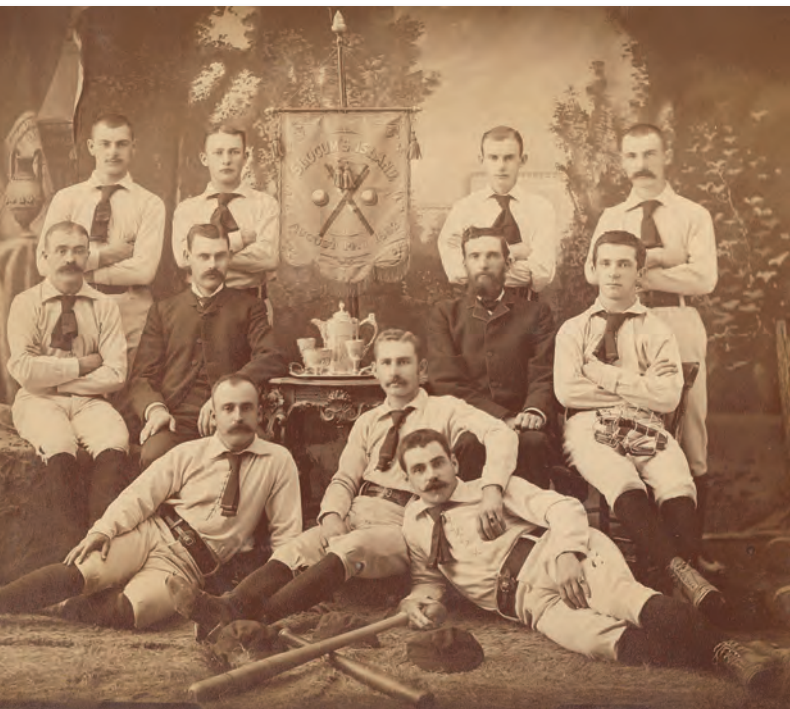
Slocum's Island baseball team. Albumen print by an unidentified photographer, 1882. The silver tea set and banner are likely trophies won at a tournament on Slocum's Island, now Elizabeth Park, near the city of Trenton. The dark-suited pair may be managers, leaving exactly nine players, one for each position.