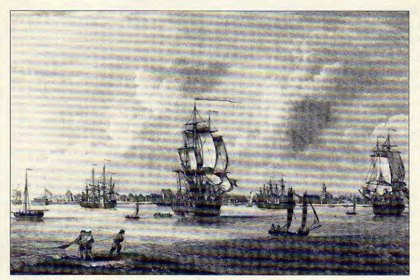
Charleston was a thriving port in the 1760s. Exports of rice and indigo, both crops cultivated by slave labor, brought annual profits of half a million pounds sterling into the South's only large colonial city. In this view from Scenographia Americana (London, 1768), Charlestown is shown from across the Cooper River with Granville Bastion on the far left and Saint Philip's Church on the right.

interest to the British government. Some were Americans living in London, others were Englishmen who had never seen the colonies, many were lawyers, some were Members of Parliament, but all of them were familiar with government politics, accomplished in the art of "dancing