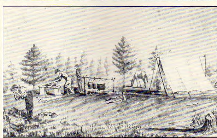
Above: "Preparing Breakfast"