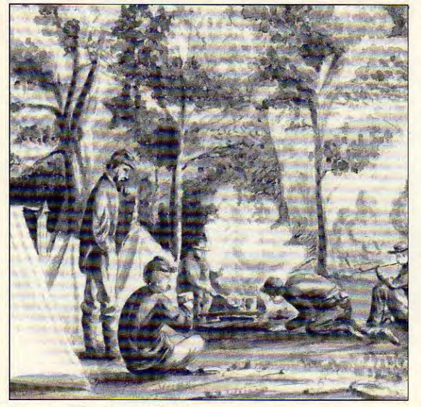
Above: "Cooking coffee."